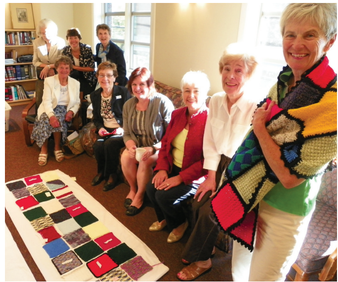
Providing numerous community outreach programs such as making prayer shawls