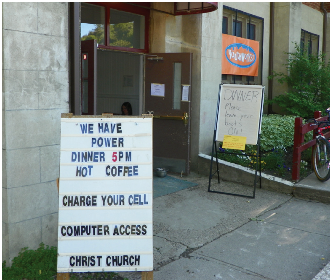
Providing local flood relief services