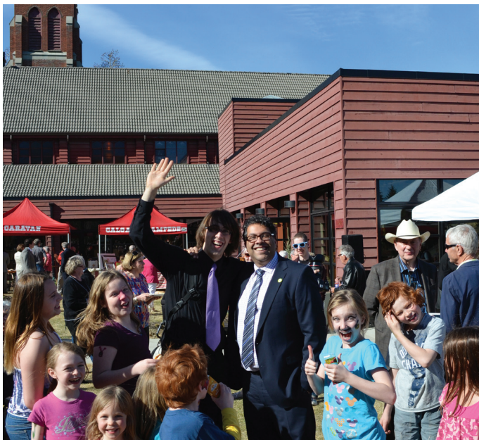
Welcomed the community with our Homecoming Celebration, Stampede Breakfast, Blessing of the Animals and many other events